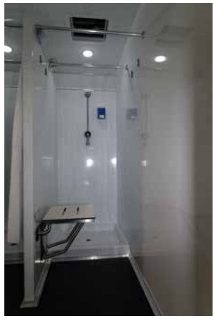
Shower Stall with Fold-Down Bench