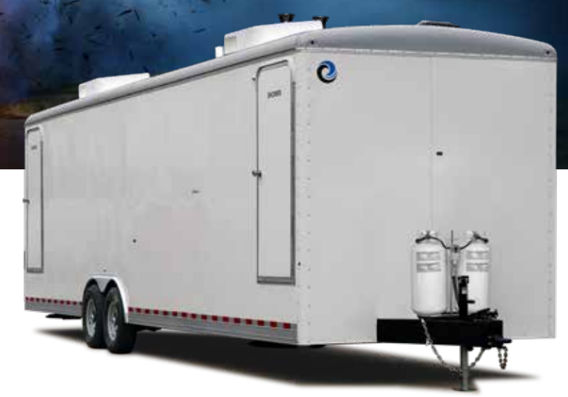
Trailer shown features optional dual 40 lb. propane on-demand tanks.

If you're tasked with providing basic necessities for disaster recovery or business continuity during unforeseen catastrophes, UltraLav and our 10-Stall Shower Trailer is just the solution. Mobile, quick to set up, and easy to maintain, this high capacity unit can provide the benefits of a clean shower for hurricane relief, forest fire support, and utility storm repair camps.