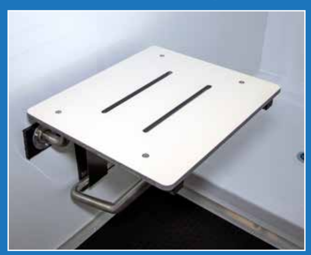
Sturdy Fold-Down Shower Bench