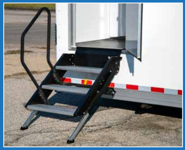
Convenient Fold-Down Step with Handrail