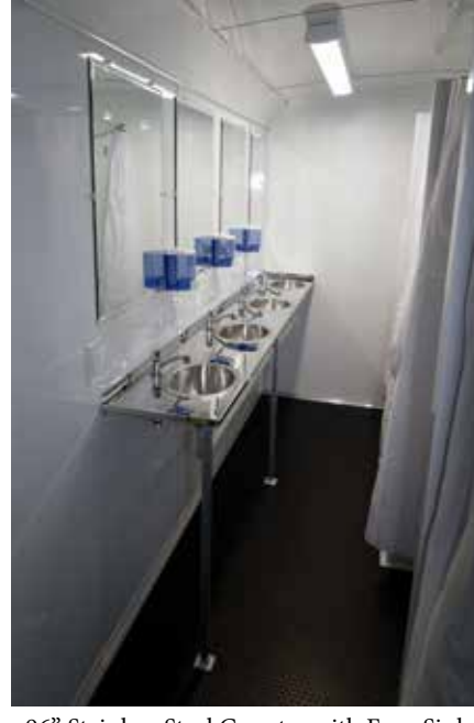
96" Stainless Steel Counter with Four Sinks